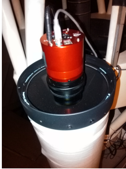
Figure 2: The 8" F/2 Rowe-Ackermann Schmidt Astrograph for wide-field imaging and transient identification, attached to the 60cm telescope.