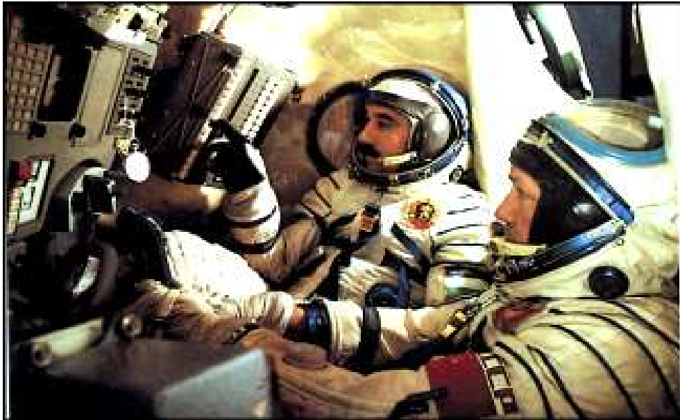
Figure 2: Astronauts Georgi Ivanov (BG) and N. Rukavishnikov (USSR) on board of SOYUS-33.

In 1981, through the two satellites INTERCOSMOS "Bulgaria - 1300" (Fig.3.), furnished entirely with Bulgarian equipment, and METEOR - PRIRODA, the National Space Program "Bulgaria-1300" was implemented, aimed at studying the ionospheric-magnetospheric relationship and remote sensing of the Earth from space. These successful experiments consolidated the priority scientific and scientific-application research areas in the country - space physics, remote sensing of the Earth, and space technology.