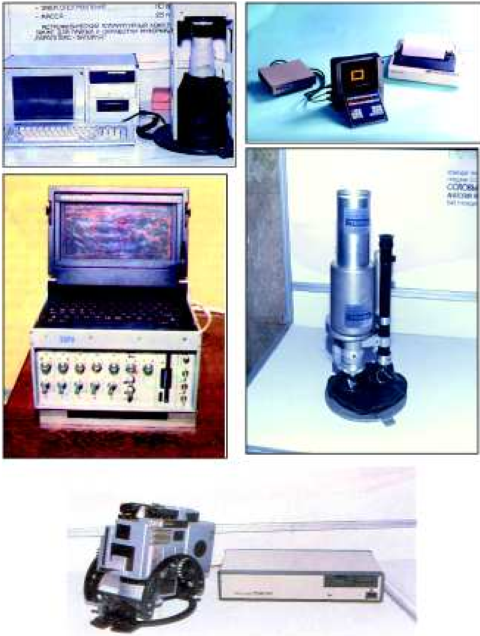
Figure 5: Space equipment made at the SRI, BAS and used during different space missions.