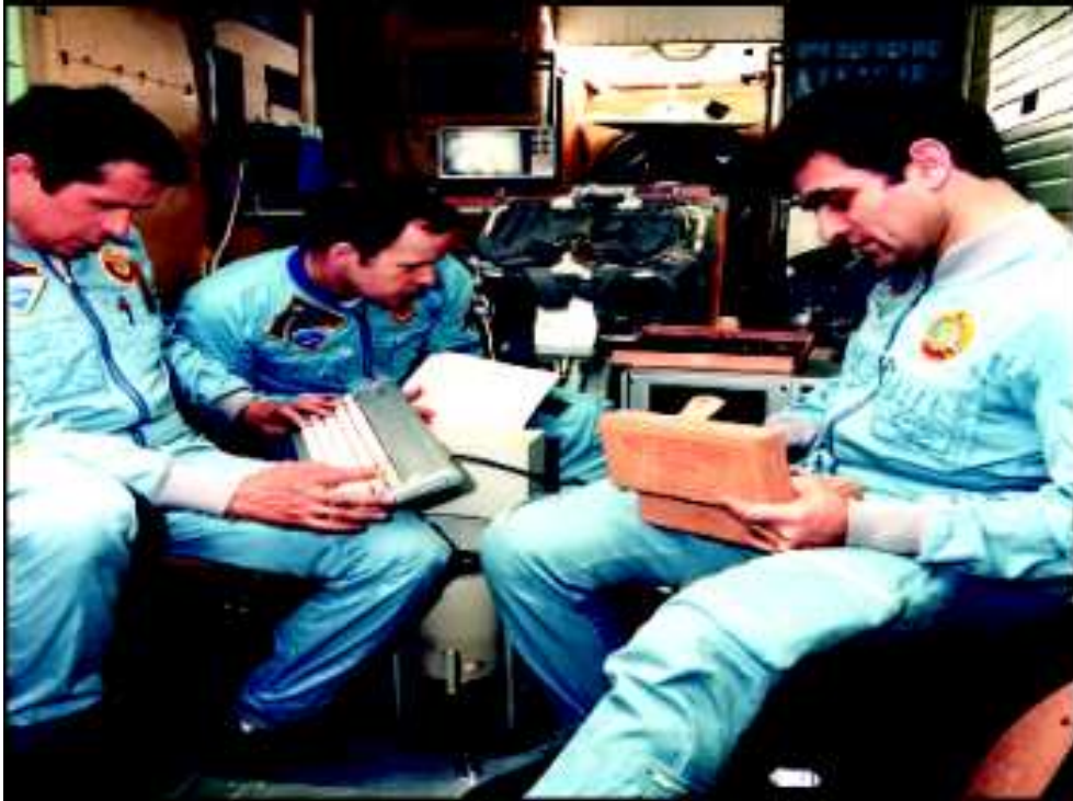
Figure 4: The second Bulgarian astronaut Alexander Alexandrov with his russian colleagues.

In the recent years, in the SRI, new programs are elaborated and a number of old programs and complexes are improved, such as: the SVET space greenhouse, the R-400 very high frequency (VHF) radiometer under the PRIRODA project, the NEUROLAB-B system for monitoring the astronauts' psychophysiological status which were flown and operated on board of the MIR orbital space station.