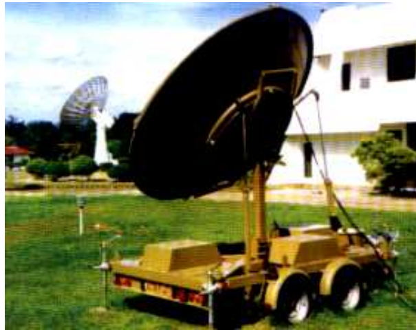
Figure 9: The mobile ground receiving station "RAPIDS".

During the project RAPIDS joint workgroup of specialist from NLR and Space Research Institute was formed. An demonstration scenario was developed and coordinated according to the proper test areas concerning schedule activities. The mobile ground receiving station RAPIDS was transported and installed near to the Space Research Institute in Sofia in 22-29 of September 2000. Bulgarian partners have organized a model of Receiving and Processing Center for remote sensing data. As result of the work were received optical (SPOT) and radar (ERS) data.