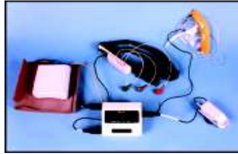
Figure 6: The "Neurolab-B" system. Figure 7: The "Holter" system.

Onboard of the MIR OS were carried out the experiments under the SVET SG space greenhouse project (Fig. 8) with the active participation of Russian and American astronauts during 1990-2000 are as follows: two-month experiments with radishes and Chinese cabbage - June-August 1990; three-month "Super Dwarf" wheat experiments - August-November 1995; six-month wheat experiments with two successive wheat crops - July, 1996 - January, 1997 (with the Utah State University, Logan, USA); four-month experiments with three "Brassica Rapa" generations - May - September, 1997 (with the Louisiana State University, USA); six-month experiments with two successive crops of a new wheat brand - November, 1998 - May, 1999; and three-week experiments with leaf crop - May - June, 2000 (with the IBMP, Moscow).