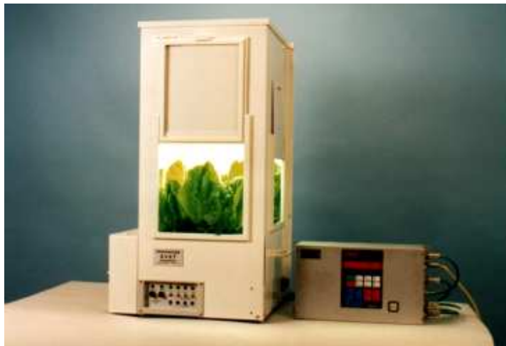
Figure 8: The "SVET SG" - first space greenhouse successfully tested at MIR OS.

The project is discussed by the international scientific community which qualifies it as one of the most prestigious ones, carried out in the 1990s on the MIR OS. Plant experiments will continue in the next 21st century on the International Space Station, for which a new generation of SVET-3 SG is being designed, along with similar NASA and ESA equipment.