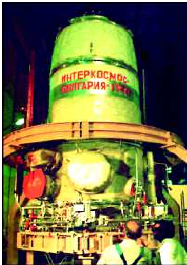
Figure 3: First Bulgarian Satellite "Bulgaria 1300" launched in 1981.

program for the second manned flight with a Bulgarian astronaut. Under the "Shipka" Program, research teams from the Bulgarian Academy of Sciences, Sofia University, the Academy of Agriculture and other universities and institutes were engaged in the implementation of more than 48 research experiments in the field of space physics, remote sensing of the Earth from space, space biology and medicine, space material science, space equipment. The flight took place in 1988 with astronaut Alexander Alexandrov (Fig. 4). The leading research institute in the implementation of the "Shipka" project was SRI - BAS. For the implementation of this research program the Bulgarian scientists designed 15 research devices and complexes which continue to work even after the Bulgarian flight as part of the equipment on the Russian MIR Orbital Space Station. In parallel with the preparation of this flight, scientists from SRI participated successfully in the international programs VENUS-HALLEY (1985-1986), PHOBOS (1988-1989), AKTIVEN (1989), APEX (1990) (Fig.5).