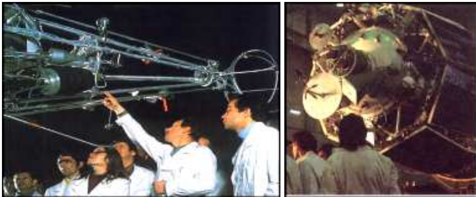
Figure 1a,b: Bulgarian scientists during the preparing of the INTERCOSMOS experiments.

In 1972, after launch of first Bulgarian equipment P-1, Bulgaria became the 18th in order space country.