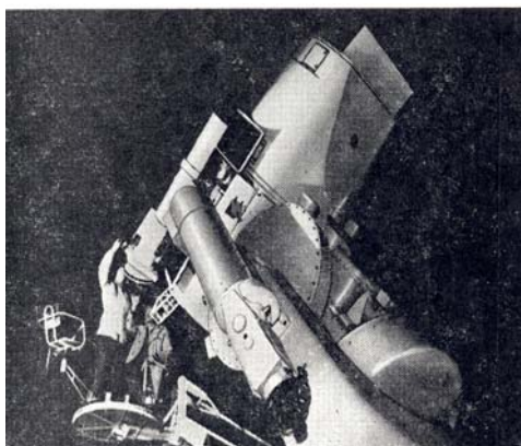
Figure 2. The camera VAU. 1