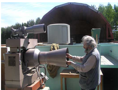
Figure 3. The camera AFU-75 and the FZT in the background.