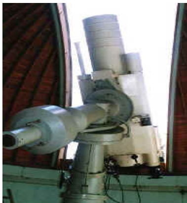
Figure 1. The Zvenigorod astrograph Carl Zeiss-400. 2