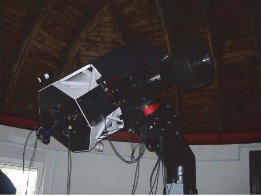
Figure 1: Telescope Cassegrain 60 cm, ASV.

B, V and R bands (three CCD images per filter). Here, we present some preliminary photometric results of objects QSO 1212+467 (in Fig. 2, the observations were done at June 27 th 2014) and BL 1722+119 (in Fig. 3, July 9 th 2013). One of our observations with 60 cm ASV is presented in Fig. 2; the exposure time exp. = 300^s in R filter. All exposures were guided.